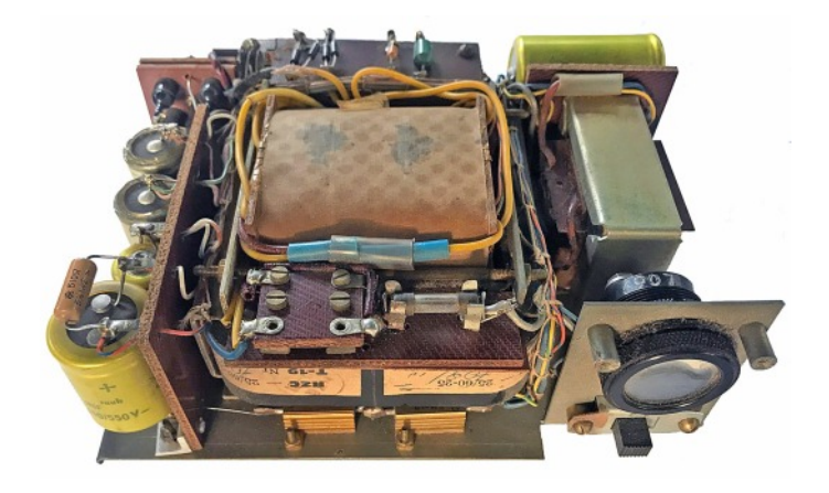
Front panel view of AC mains power unit with its cover detached showing meter and on/off switch.