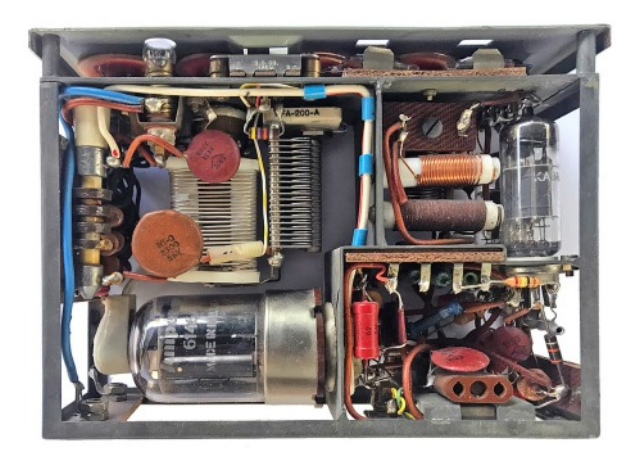
Top view of transmitter with its cover removed.

© This WftW Volume 4 Supplement is a download from www.wftw.nl. It may be freely copied and distributed, but only in the current form.